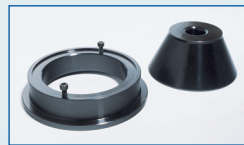
Optional: Light truck cone set –