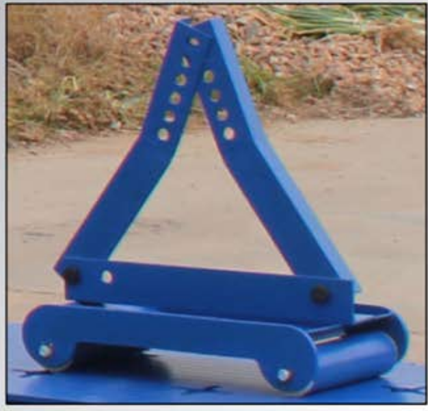
Universal Wheel Stand & Dead Vehicle Dolly